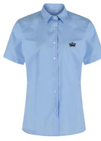
Blue Short Sleeve Blouse NSB-BLU Badge to SB1