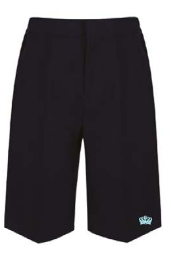
Navy Senior Short TSH-NVY Badge to BT14