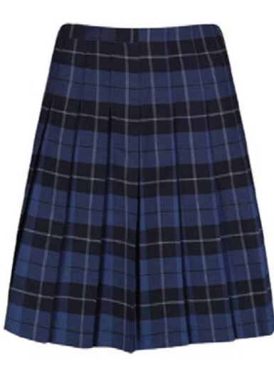
Stitch down Pleated skirt GST-PEN