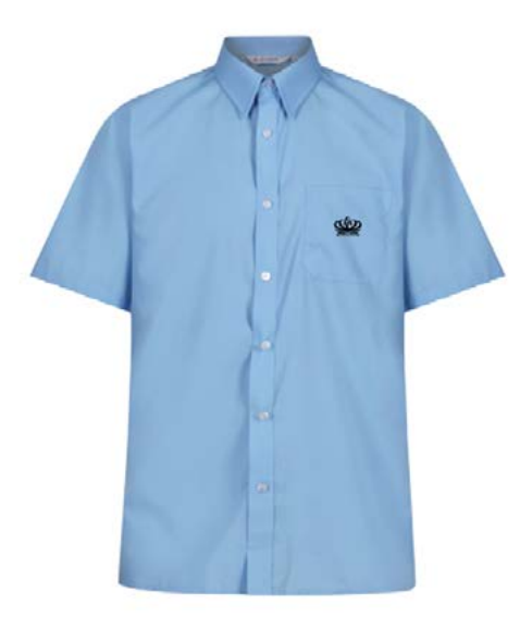
Blue Short Sleeve Shirt NSS-BLU Badge to SB32