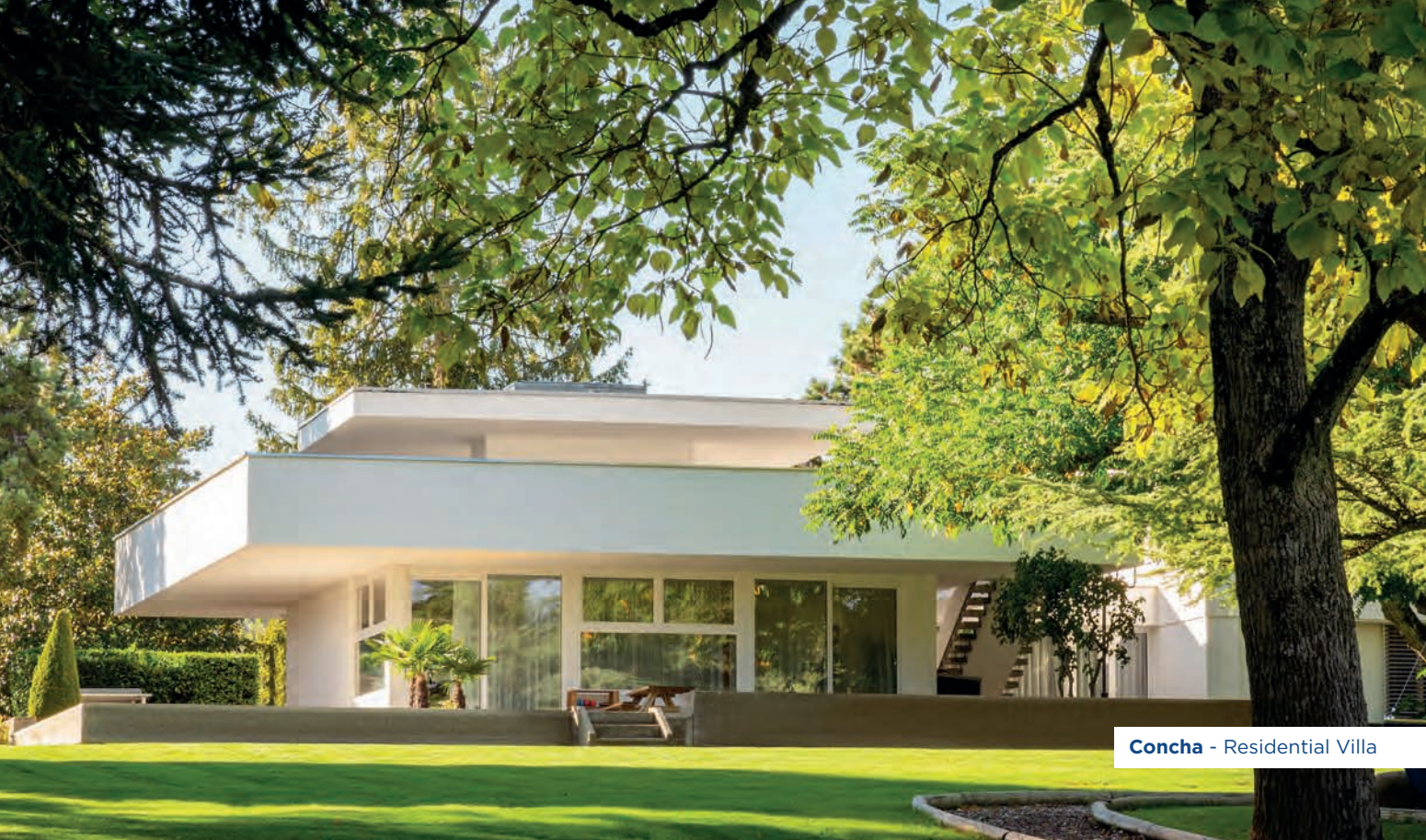
Concha - Residential Villa