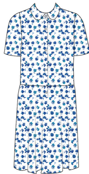
Summer Dress KSB Royal Flora Print