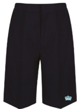
Junior Skort MESKO-NVY Badge to SK34