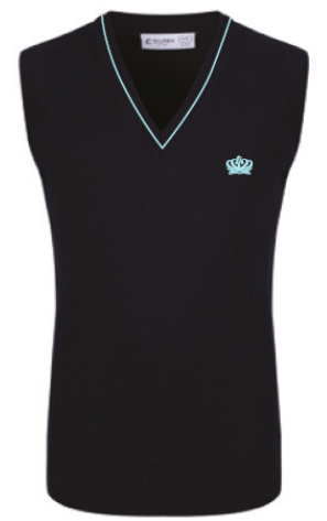
Navy Cotton Tank Top SCBT N1 Sky Blue stripe and Badge to KN1