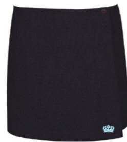
Junior Skort SPS-NVY Badge to BT14