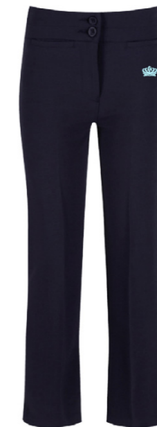
Navy Junior Fitted Trousers JGTN-NVY Badge to GT12