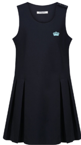
Navy Pinafore JPP-NVY Badge to PN1