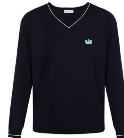
Navy Cotton V-Neck Jumper SCBV N1 and C14 Sky Blue stripe and Badge to KN1