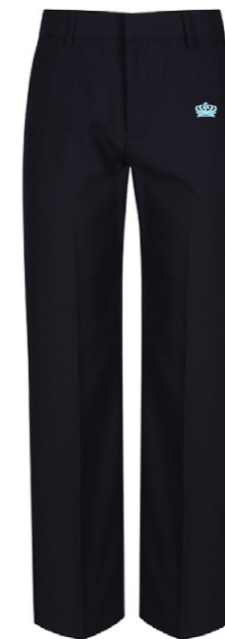
Blue Junior Trousers CFJ-NVY Badge to BT4