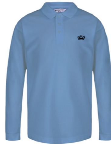
Blue Long Sleeve Poloshirt PCL-SKY Badge to PS1