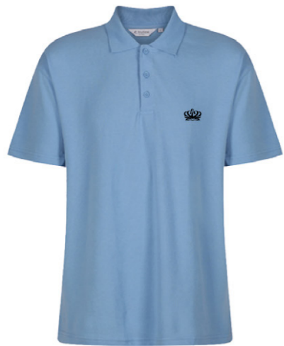
Blue Poloshirt PCH-BLU Badge to PS1