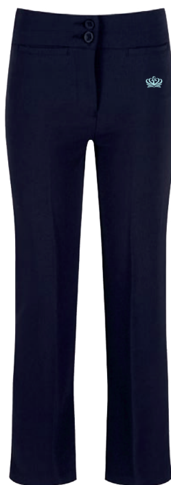
Navy Junior Fitted Trouser JGTN-NVY Badge to GT12