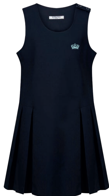
Navy Pinafore JPP-NVY Badge to PN1