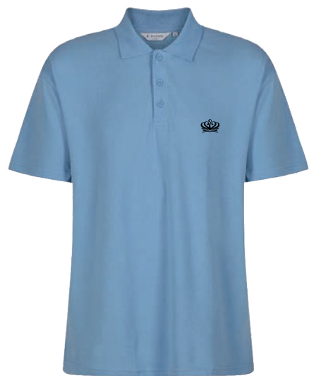
Blue Poloshirt PCH-BLU Badge to PS1