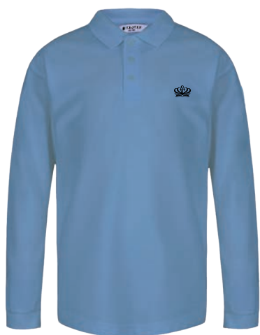
Blue Long Sleeve Poloshirt PCL-SKY Badge to PS1