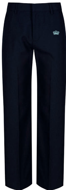
Navy Junior Trouser CFJ-NVY Badge to BT4