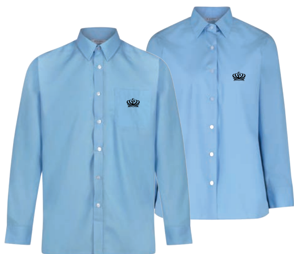
Blue Long Sleeve Shirt/Blouse NLS/NLB-BLU Badge to SB32/SB1