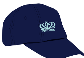
Navy Baseball Cap