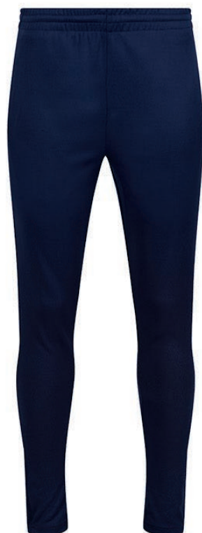
Navy Pulse Track Pant KSP-NVY