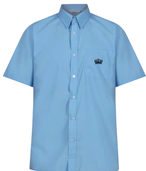
Blue Short Sleeve Shirt NSS-BLU Badge to SB32