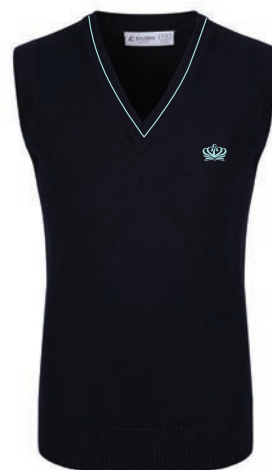
Navy Cotton Tank Top SCBT N1 Sky Blue stripe and Badge to KN1