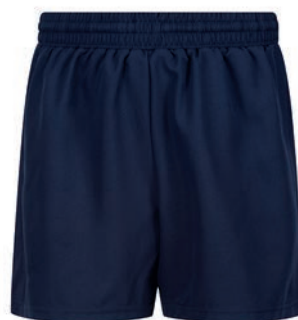
Navy Pulse Short KSH-NVY