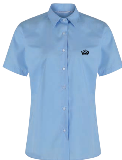
Blue Short Sleeve Blouse NSB-BLU Badge to SB1