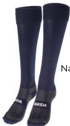
Navy Pro Sock ANS-NVY