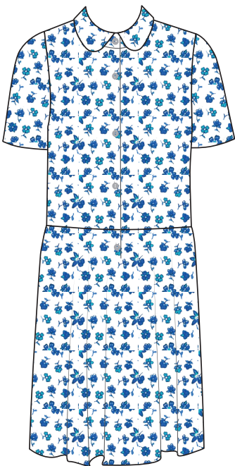
Summer Dress SKB Royal Floral Print