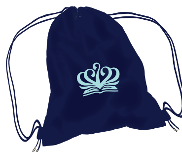
Navy Rucksack Gym Bag