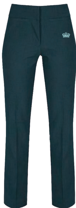
Senior Fitted Trouser GTI-NVY Badge to GT12