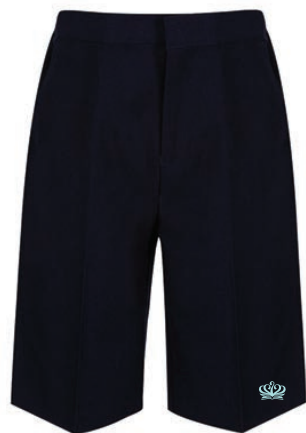
Junior Short MESKO-NVY Badge to SK34