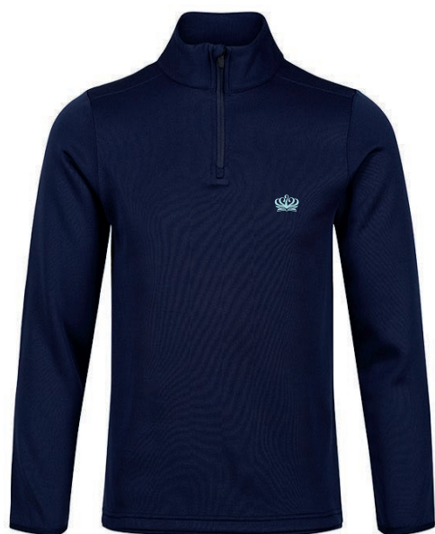
Navy Pulse Sports Jacket KLS Badge to SC1