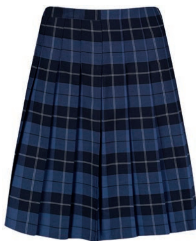
Stitch down Pleated skirt GST-PEN