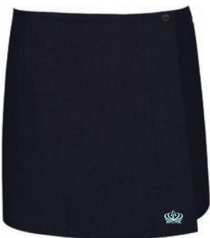
Junior Skort SPS-NVY Badge to BT14