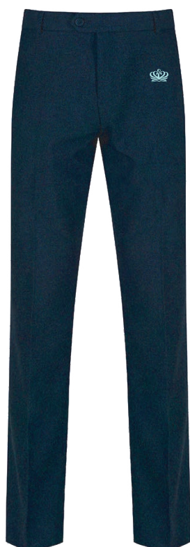
Senior Trouser TLT-NVY Badge to BT4