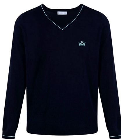
Navy Cotton V-Neck Jumper SCBV N1 and C14 Sky Blue stripe and Badge to KN1