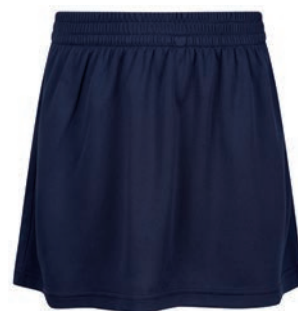
Navy Pulse Skort KSK-NVY