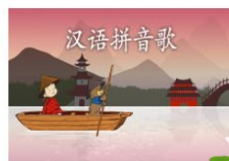
Chinese Pinyin Song