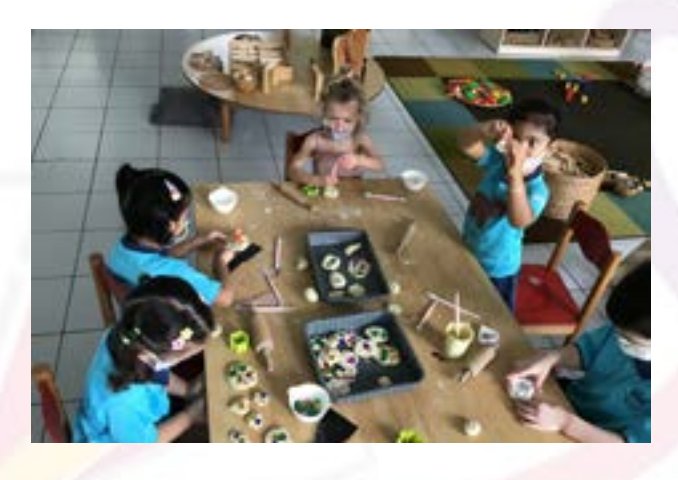
Foundation 1 Penyu