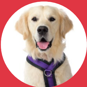
Percy Wellbeing Support Dog